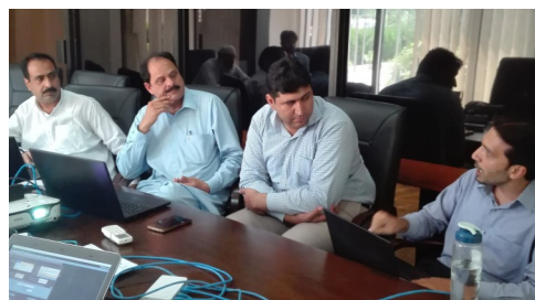
The UAT session of Payroll processes is in-progress and discussions are going on regarding integration of Payroll module with Financials modules. HR users, Member of PMO and ERP Consultants can be seen in above image.