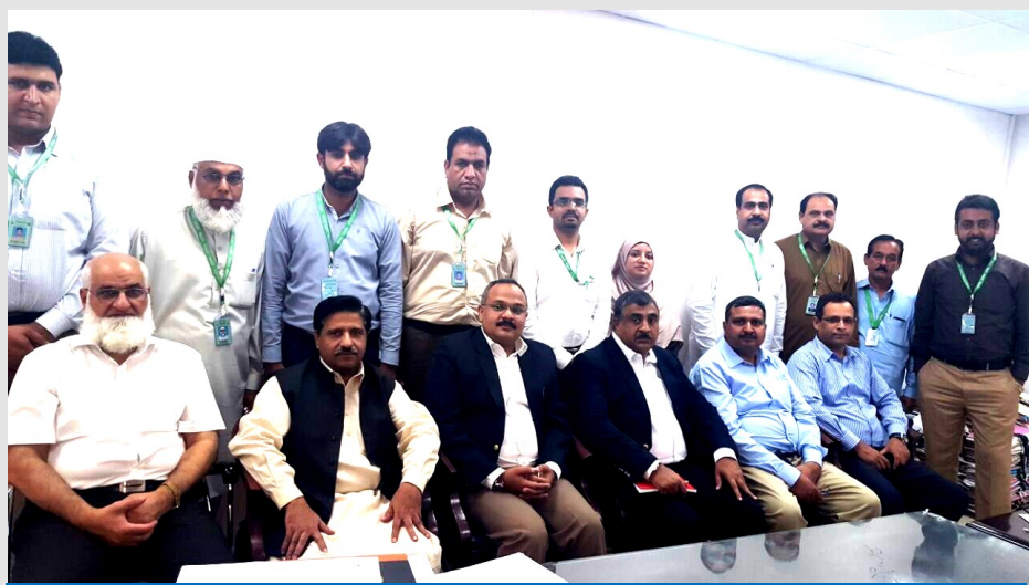
Group photo with CEO CPPA on the occasion of Go-Live of ERP HRMS System

We are thankful to the entire project team for its sustained and unflinching dedication during turbulent and testing times and wading through them successfully. Here, you all are kindly urged to fully own the system as end-users and take full charge of it!!!