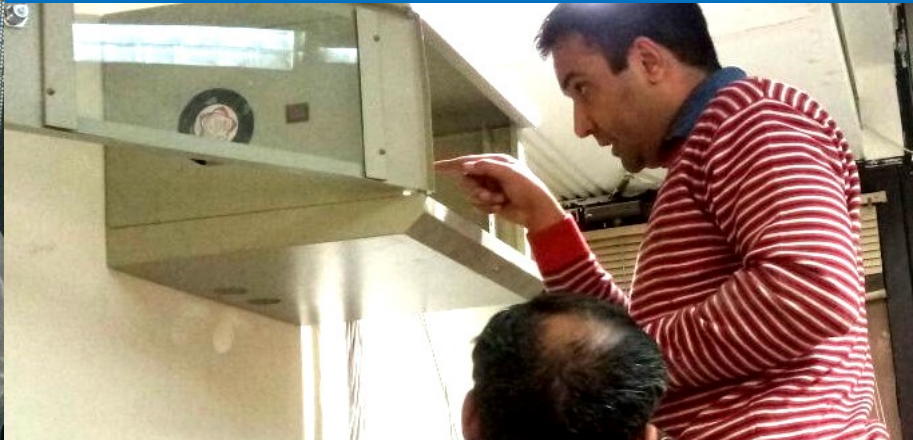
IT Vendor's team is installing Network Cabinets for Access Switches, Patch Panels and UPS to ensure the connectivity with the various applications running at DC.