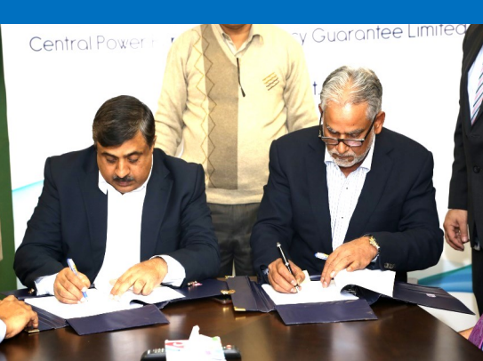
CEOs of both companies are signing contract.