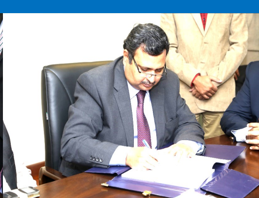
Management of CPPA-G signing the contract