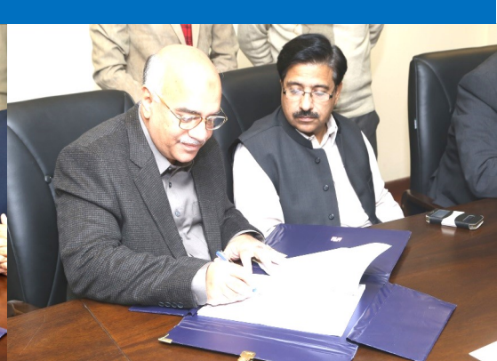
Management of CPPA-G signing the contract